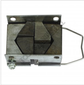
Shrinker Rear View