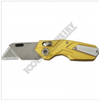
Side View Blade Opened